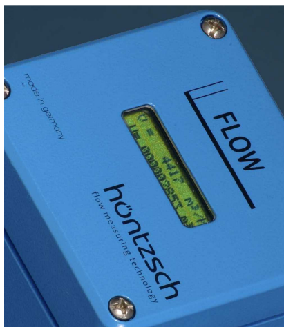
optional LCD display in the housing cover